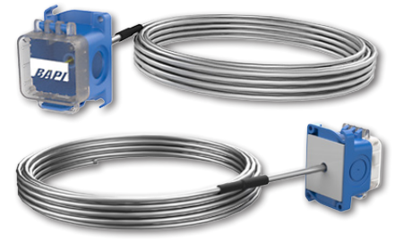
BAPI-Box Crossover Enclosure