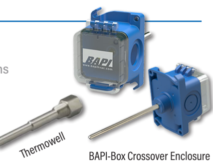
BAPI-Box Crossover Enclosure