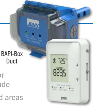
BAPI-Stat "Quantum Prime"