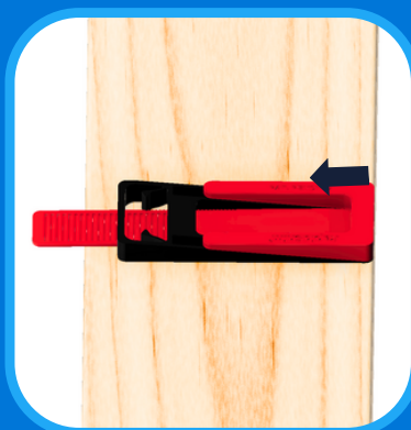
Insert top wedges. Push until the wedges click into place.