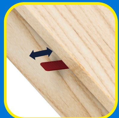
Add door jamb, then pull or push tabs to quickly adjust spacing. When done, snap the tab off.