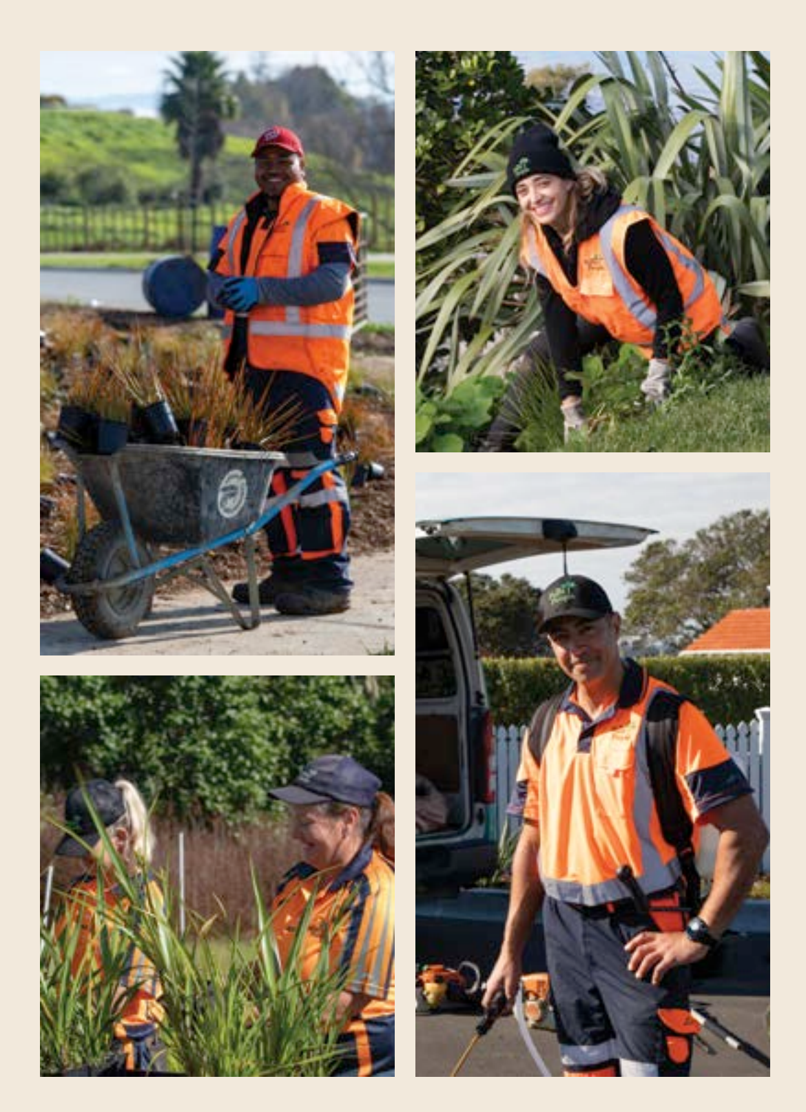
MUCH MORE THAN JUST PLANTS